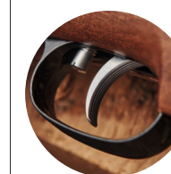
Weihrauch's excellent two-stage Rekord trigger delivers crisp shot release and is easily adjusted via the screw just behind the blade

I like pistol grips with a steep rake. The angle of the grip on this Weihrauch is far from vertical, but I found it more than adequate and, most importantly, it ensures sound trigger attack.